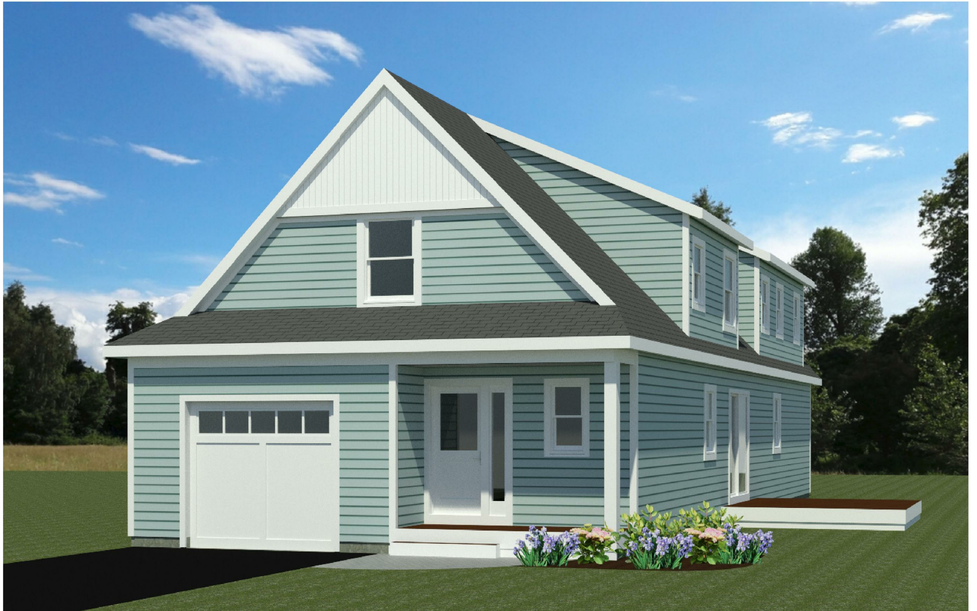
2 BEDROOM -DUPLEX