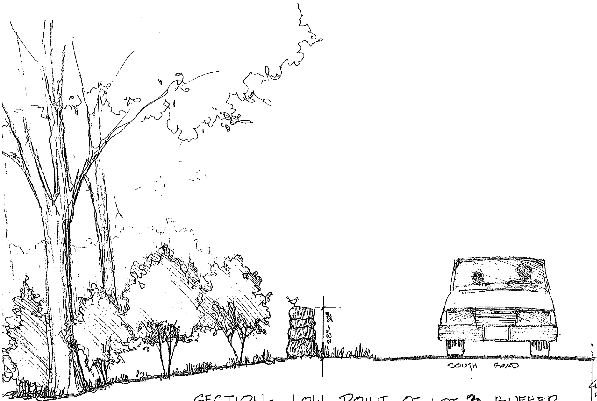
SECTION - LOW POINT OF LOT 3 BUFFER SCALE: 1" = 2'-0"